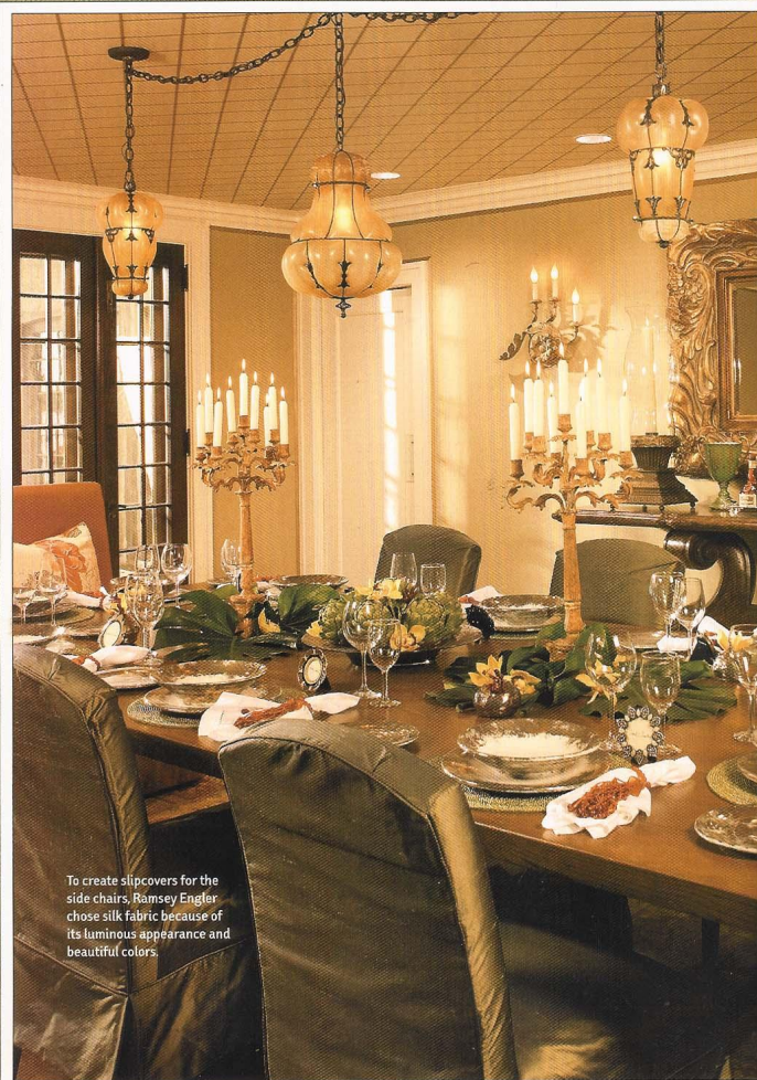
To create slipcovers for the side chairs, Ramsey Engler chose silk fabric because of its luminous appearance and beautiful colors.